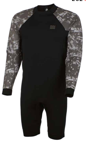
MEN'S 2/2MM SHORTY WETSUIT LONG SLEEVE Black with Graphics, Orange 286822

MEN'S MONTEGO JACKET Black, Lava Red, Navy, Aqua