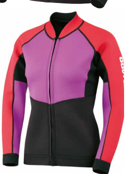
LADIES' MONTEGO JACKET Lilac, Navy, Teal, Violet 286821