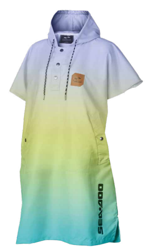
NEW UNISEX SEA-DOO QUICK- DRY PONCHO BY SLOWTIDE<sup>†</sup> Lilac, Navy 288059

Wear your passion wherever you go with this new head-turning apparel collection.