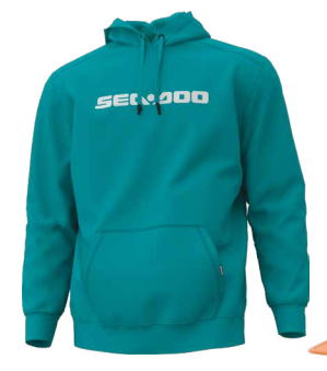
MEN'S SEA-DOO HOODIE SIGNATURE Lava Red, Black, Aqua 454890