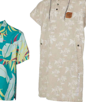
NEW UNISEX SEA-DOO EXTRA WARM PONCHO BY SLOWTIDE<sup>†</sup> Sand 288060