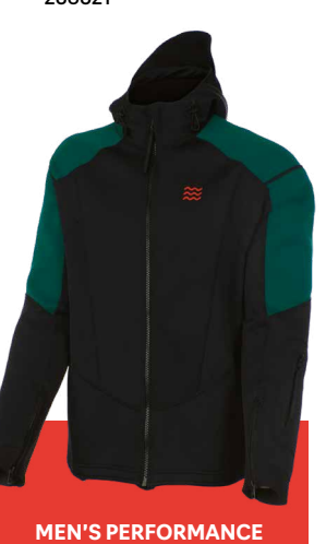
MEN'S PERFORMANC RIDING JACKET Black 286831

There's a new material in town: airprene, a perforated version of the classic neoprene used in wetsuits. The softer, thinner and more agile fabric improves comfort at the neck, underarm and side panels in some of our newest wetsuits and riding jackets.